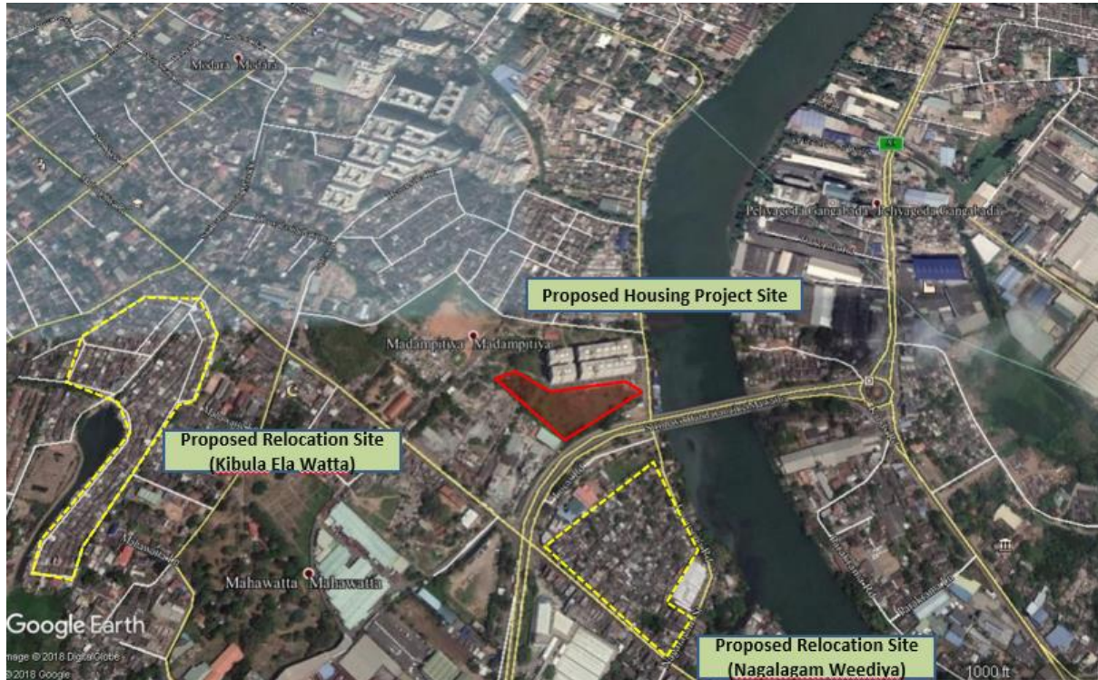
Figure 1: Location of the project site and the development plan for the area

Mawatha. The land adjoins a similar housing complex (old) on one side. Area is mixed developed, predominantly industrial and commercial. See Figure 1 for site location area and UDA's development plan for the area.