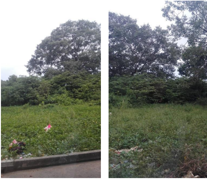
Figure 2: Pictures of the proposed land

750 new housing units have been proposed for Ferguson. A layout plan was unavailable at the time of assessment but will be developed by the design and build contractor upon award of the bid. Each apartment tower will consist of the ground floor and another 15 floors. Ground floor will consist of courtyards (open to sky), shops, community hall, maintenance office, nursery and day care center, common toilets, police post cum fire commanding center and janitorial room per block. Each apartment tower will also have a health center and a parking area. Each housing unit within the apartment complex will have a minimum floor area of 500 sq.ft. Each housing unit will include living room, two bed rooms, kitchen, bath and toilet (separated) and balcony. Brief detail of the common commodities planned under the scope of work for this subproject by UDA is provided below.