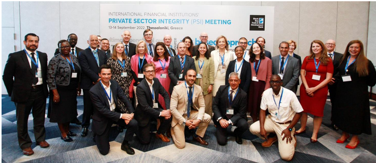
MD-CEIU and CEIU Integrity Head join IFI delegates at the Private Sector Integrity Meeting.

issues in IFI private sector operations, including integrity due diligence, AML/CFT, market abuse, data protection/privacy, among others.