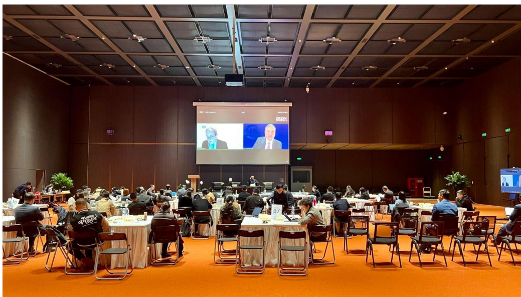
CEIU Integrity Head presenting in the MCDF-AIIB-CHINCA Workshop on MDB Procurement and Financing Business Opportunities and Policies, Nov. 2022.

CEIU spoke as part of a panel on “ The Challenges for MDB Project Procurement and Contractors under the Current Global Economics and Institutional Sanctions Regimes ” for the “ Workshop Series on MDB Procurement and Financing Business Opportunities and Policies ” for Chinese contractors, suppliers and consultants. This event was organized by Multilateral Cooperation Center for Development Finance (MCDF), China International Contractors Association (CHINCA), and AIIB.