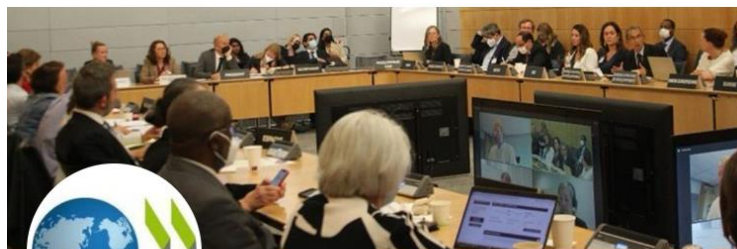
28 th Meeting of the OECD/DAC EvalNet.

CEIU also participated virtually in the hybrid OECD/DAC EvalNet 28 th Annual Meeting (June 20-21) and discussions with peer UN, MDB and bilateral development agency members of EvalNet. Key topics included (a) the COVID-19 Global Evaluation Coalition; (b) an update on the Evaluation