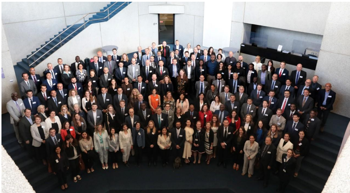
CEIU Integrity Head joins other investigations professionals at the 22 nd Conference of International Investigators.

CEIU attended the 22nd Conference of International Investigators (May 30 to June 3, 2022) in Luxembourg, which was hosted by the European Investment Bank (EIB). More than 150 investigators from Multilateral Development Banks, International Financial Institutions, United Nations agencies and other international organizations attended the session in person, along with over 450 online participants. The participants discussed issues of common concern in the field of investigation and hot anti-corruption topics in relation to the challenges of the COVID-19 pandemic, climate change, and the rise of cryptocurrency.